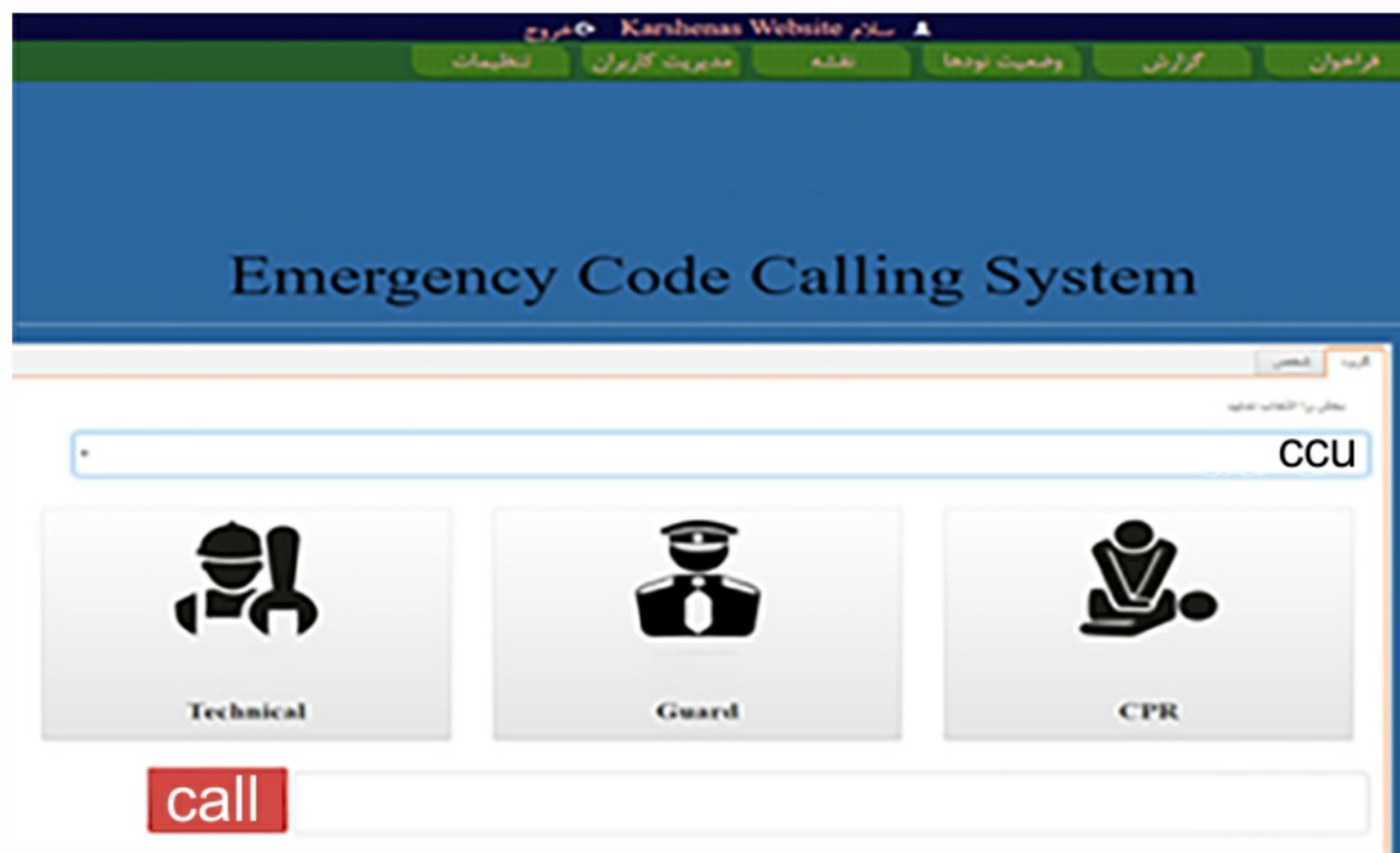
web-based PC GateWay

The KTC-RN-S APP is android application connecting to the KTC-RN-S server through its web gate to initiate code calls.